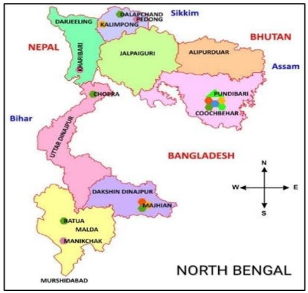
Figure 2 North Bengal Map